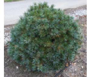
Pictured at right.

Pinus strobus 'Nana' (Dwarf Eastern White Pine) Zone 3 - Dwarf multi-stemmed variety, with bluish-green needles. Dense, rounded habit when young, ages into a large irregular mound with time. Can be sheared to maintain a round habit. 1.25M/4' tall by 2.25M/7' wide.