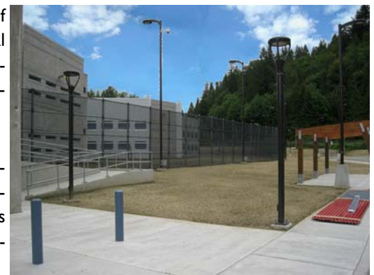
Recently Hydroseeded Grass Area

To assist in achieving LEED Gold certification for the project, drought tolerant plant species were selected, no irrigation system was installed, and existing onsite materials such as topsoil and boulders were reused within the landscaping.