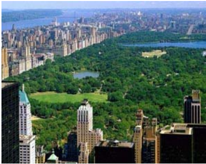
Central Park, New York City

From the ASLA Publication 'The Dirt', Dec. 12/2010