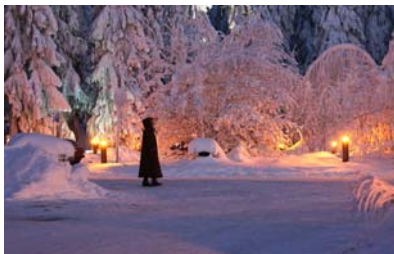
A breathtaking, lit-up winter landscape.

The design and installation of night lighting requires careful planning, (similar to the design of other elements in your garden), to ensure the desired mood is developed. In many instances, some preliminary experimenting is necessary, and can be accomplished with a GFI (ground fault circuit interrupt) outlet, appropriate extension cords, and one or more lighting techniques.