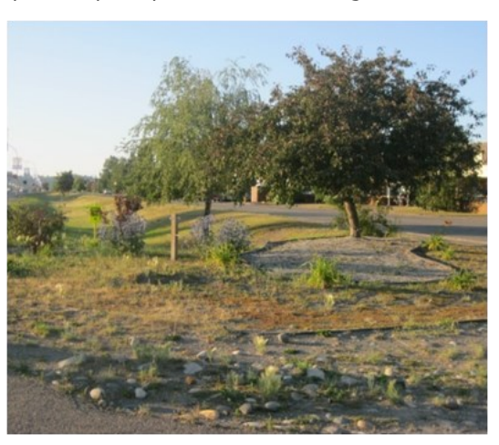
High maintenance flower beds lacking required attention.

I am only suggesting that park and open space funding receive its due share and attention. A stronger argument maybe needed to convince decision makers that the numerous park / open space benefits strengthen our