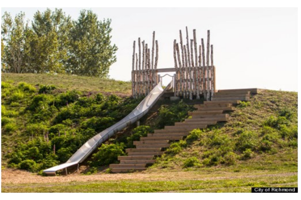
Reference: www.Huffingtonpost.ca Sustainable Children's Playground in Richmond, BC Adds interest with minimum maintenance.

communities, make our cities and neighbourhoods more attractive places to live and work, and improve our physical and psychological health.